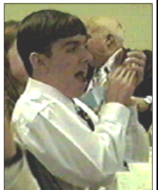
Above: The Stigman applauds the G-Man's victory Thursday.

The Italians will try to extend their success into the on Chapter 11, Sections 1, 2, and 3. It will be worth at least 40 points.