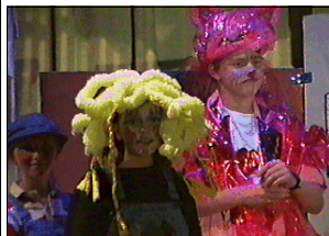
The Scarecrow (center) sings as the Glass Cat (right) and Ojo (left) look on.