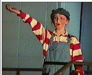
Ojo sings about his bad luck in a song called "Ojo the Unlucky"