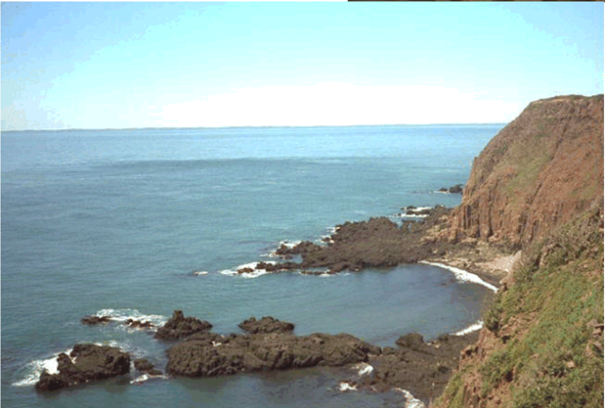
Above: A view of the magnificent Southwest Head cliffs on Grand Manan Island. We apologize for the strange coloration of the sky and parts of the water in this picture. This error is caused by the conversion of this Photo CD image into a bitmap (BMP file).