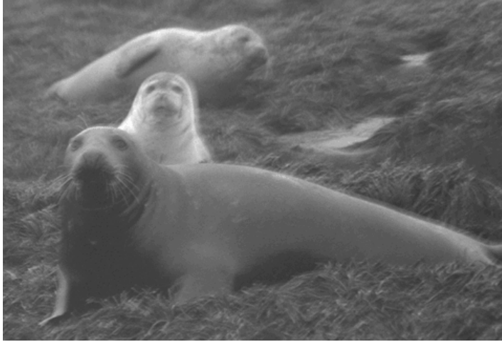
Above: Seals near Grand Manan Island.