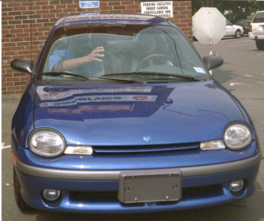
Above: Our brand new Neon at Papa's Dodge, just a few minutes after we bought it. Inside the car, an employee teaches my Mom and Dad all about the features of the Neon.