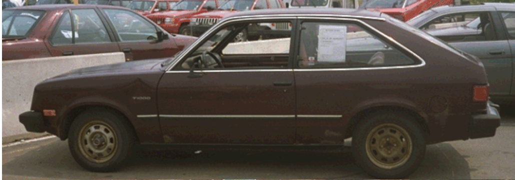
Left: The Pontiac T-1000, just a few minutes after we traded it in, on the lot at Papa's Dodge. Note the window sticker in the back seat window.