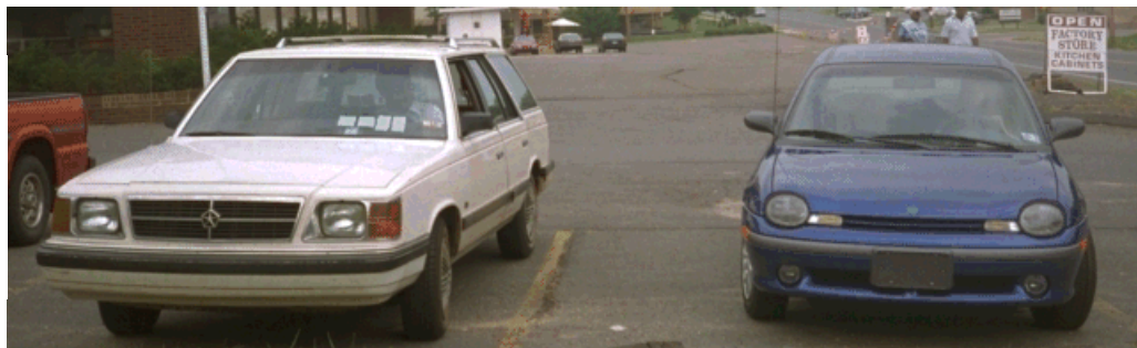
Right: The two cars we own now—Dodge Aries and Dodge Neon—in a parking lot. Picture taken about thirty minutes after we bought the Neon.