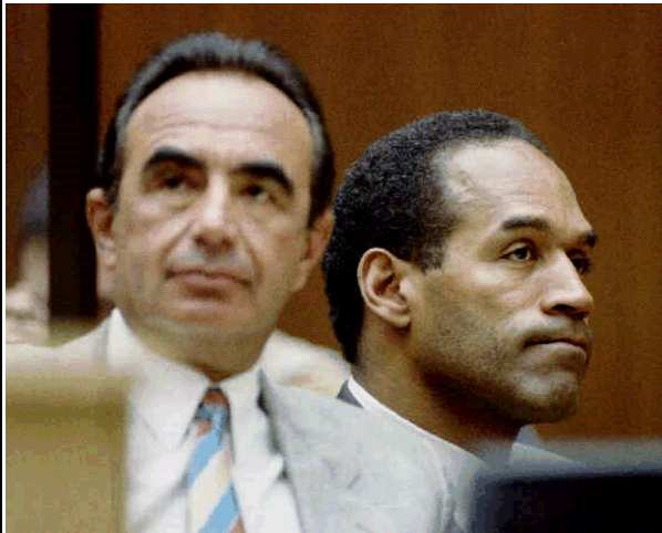
Above, from left: Defense Attorney Robert Shapiro, Defendant O.J. Simpson