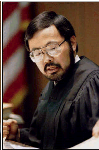
Above: Judge Lance Ito